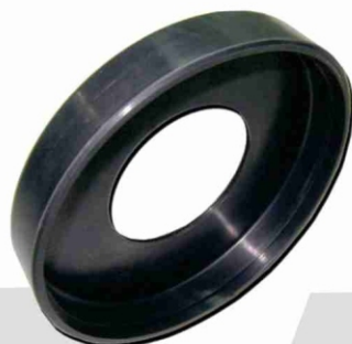
GUARDA PÓ DO