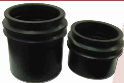
GUARDA PÓ (SANFONA)